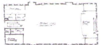
ONE YOUTH: NIAGARA BRIDGE OF HOPE AND SERVICE - ACCESSIBILITY STUDY - THIRD FLOOR

The grant allowed us to complete an accessibility study of an elevator for the school. The work was completed by Foit-Albert Associates of Buffalo, New York.